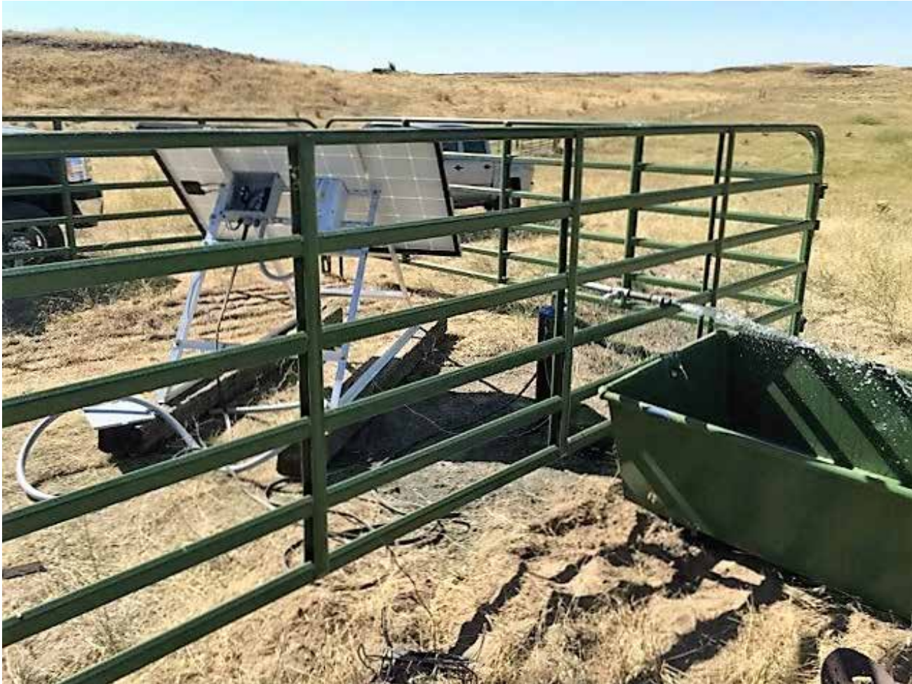
Solar Powered Stock Watering Wells