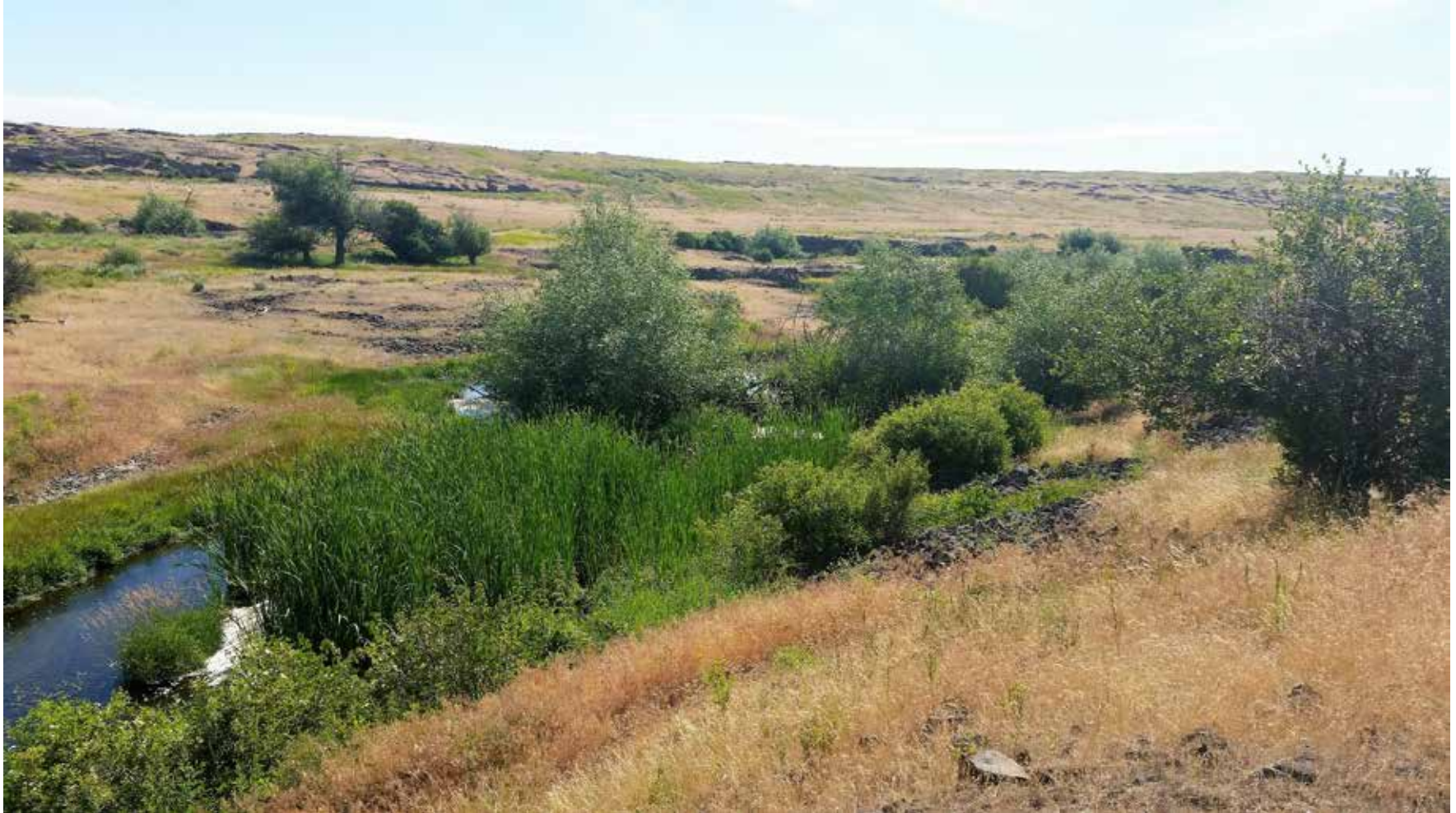
Middle Crab Creek – Riparian Area