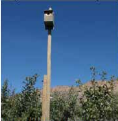
Raptor Pole with Nesting Box