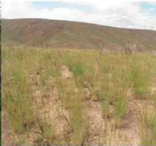
Replanting after a Fire