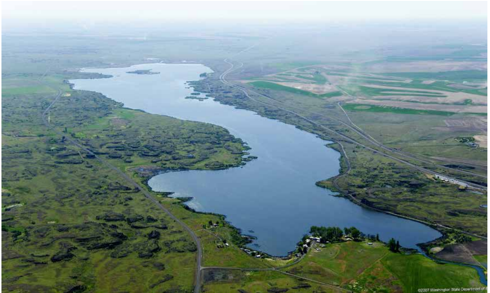
Sprague Lake (looking southwest)