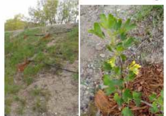
Wildlife and Pollinator Habitat Planting

in an orchard and long side a field road