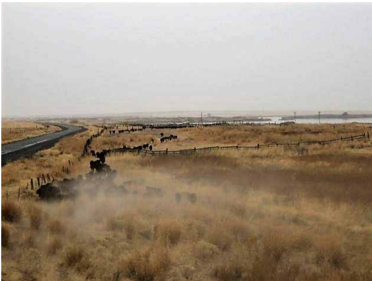
Yearlings grazing (2014)