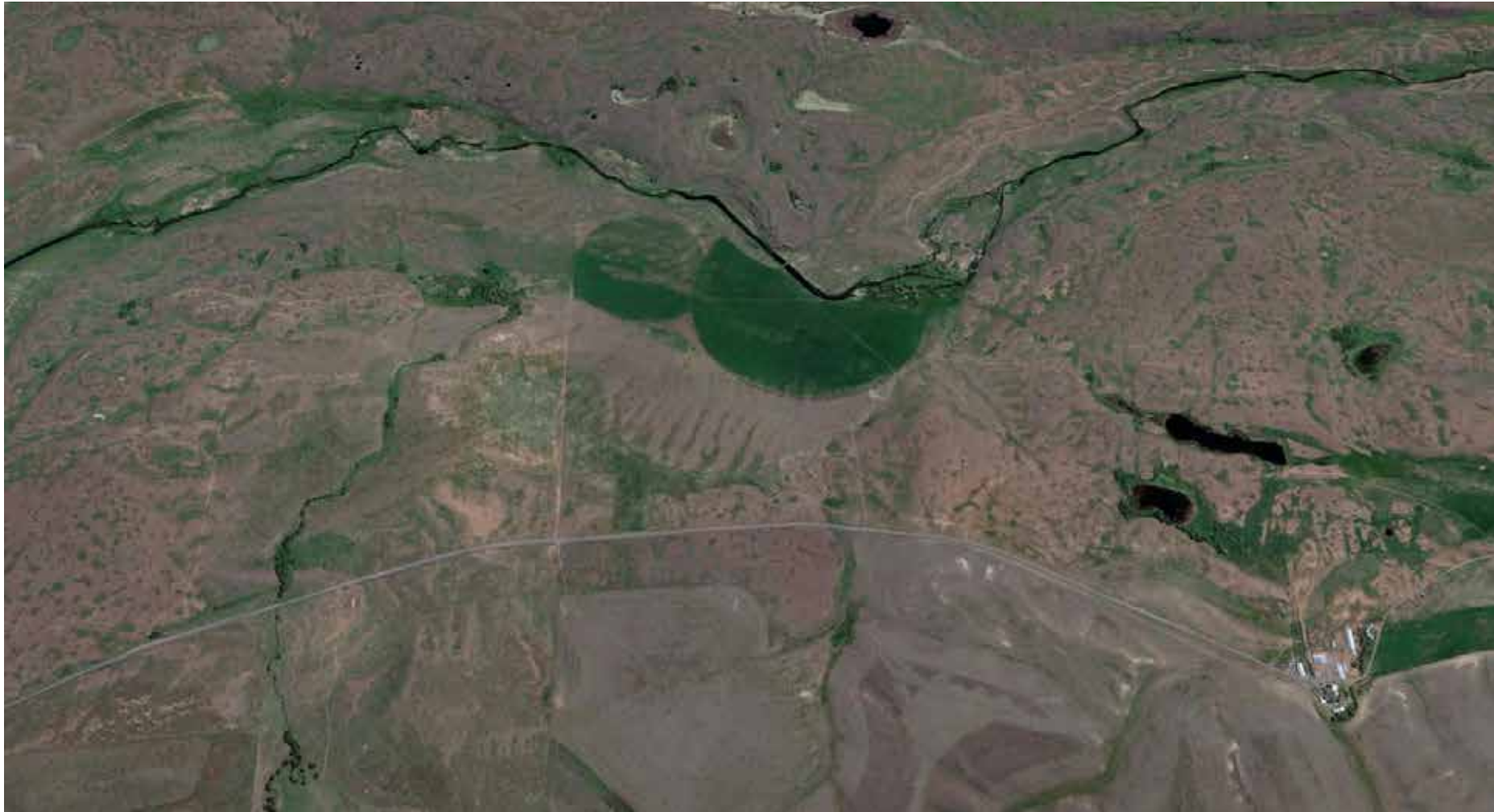
Crab Creek (north is to the left)