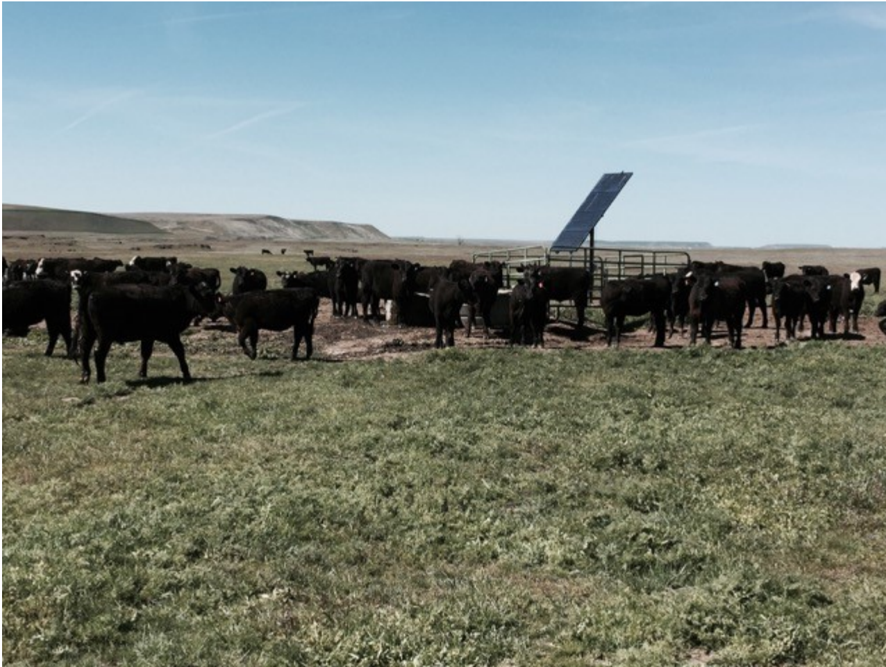
Yearlings enjoying fresh water (2014 to present)