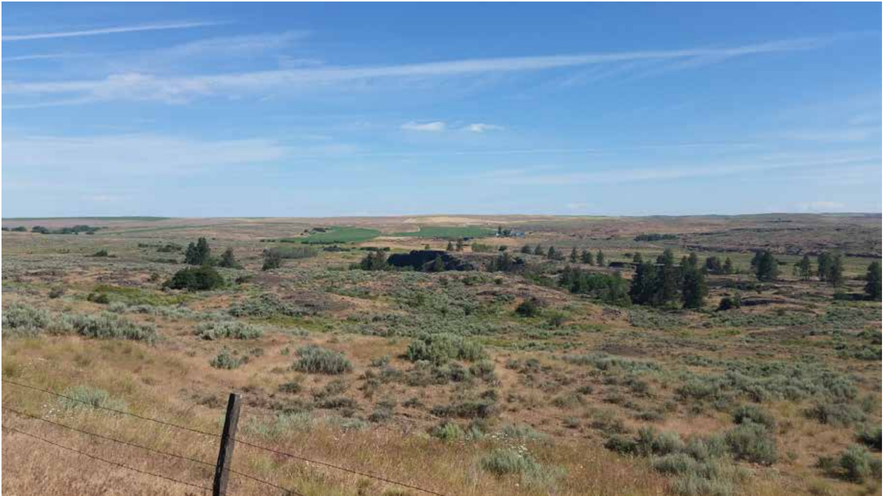
Scrub shrub rangelands – Middle Crab Creek