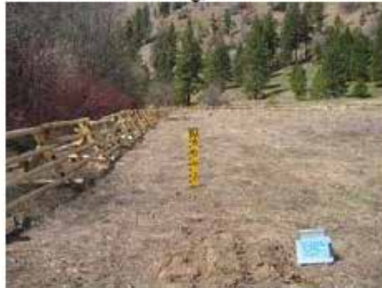
Livestock Holding, Exclusion Fence

Tillicum Creek Fence Project, Mad River drainage, Entiat.